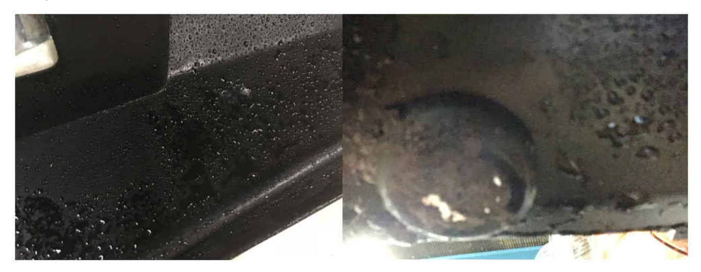
Figure 3. Water on Capacitive Sensor, and Mud on Ultrasonic Sensor

Ultrasonic transducers are inherently narrowband in their response, as they have a specific resonant frequency. However, wideband acoustical noise sources such as the white noise from air brakes may have significant content in the ultrasonic range of the transducer, which can be falsely perceived as an echo. Because the transducer must be exposed to the environment to function, it is also vulnerable to contamination by rain and mud, which can have a negative impact on the effectiveness of the sensing application. Figure 3 shows examples of water and mud on the sensors.