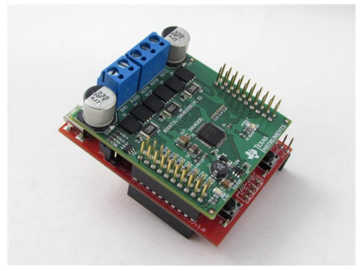
Figure 2. LAUNCHXL-F28027F + BOOSTXL-DRV8305EVM

control. Now, we are releasing the BOOSTXL-DRV8305EVM (Figure 2) using our next-generation BLDC motor gate driver.