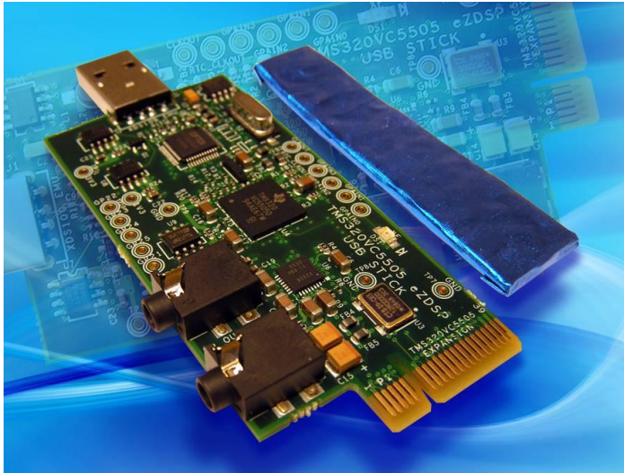
C5505 eZDSP USB Stick Development Tool Part#: TMDX5505EZDSP $49

TI's University Programme started in 1994 with a simple goal: to enable the widest possible use of real-time signal processing to be achieved in the classroom using industry standard TI processors and software.