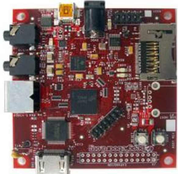
The "Beagle Board" based on OMAP3530 http://beagleboard.org/ $149

TI provides universities with teaching materials, workshops, technical support and special pricing. There are three DSP processor families to choose from: C6000, C5000 and OMAP.