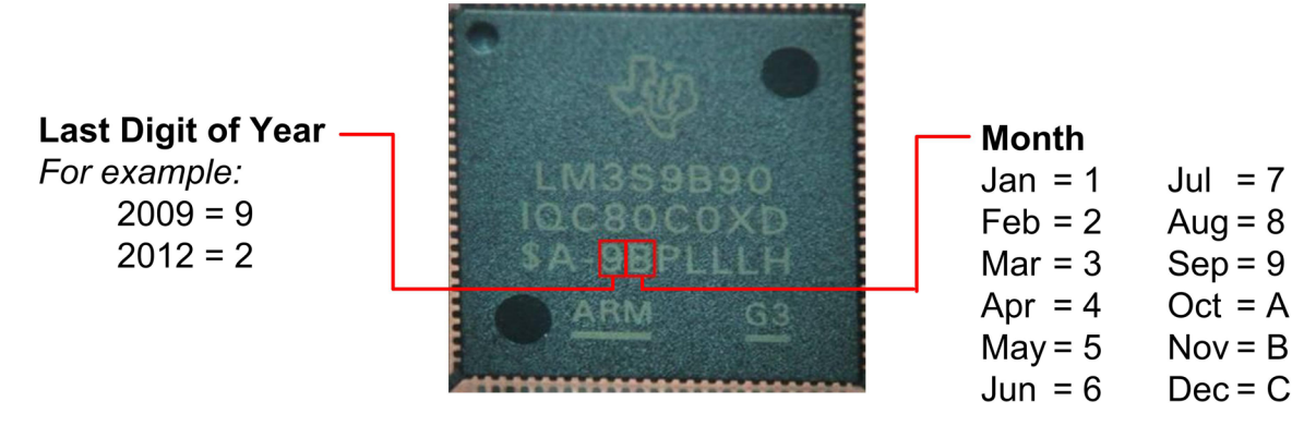
Figure 1. Example of Device Part Markings

Stellaris® LM4F microcontrollers are marked with an identifying number, as shown in Figure 1. Lines 1 and 2 contain the part number and revision of the device, as well as two internal tracking numbers. Line 3 contains an internal tracking number, including the date code.