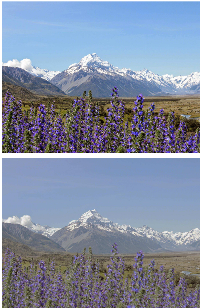
Figure 2. Simulated Images of High Contrast (Above) and Low Contrast (Below)

There are two methods of measuring a systems contrast ratio: Full-On / Full-Off (FOFO) Contrast and ANSI Contrast. FOFO Contrast is essentially a measurement of the display panels inherent contrast ratio, whereas ANSI Contrast is essentially a measurement of the projection optics contrast ratio. DLP technology can enable contrast ratios of over 2,000:1, depending on the projection optics design.