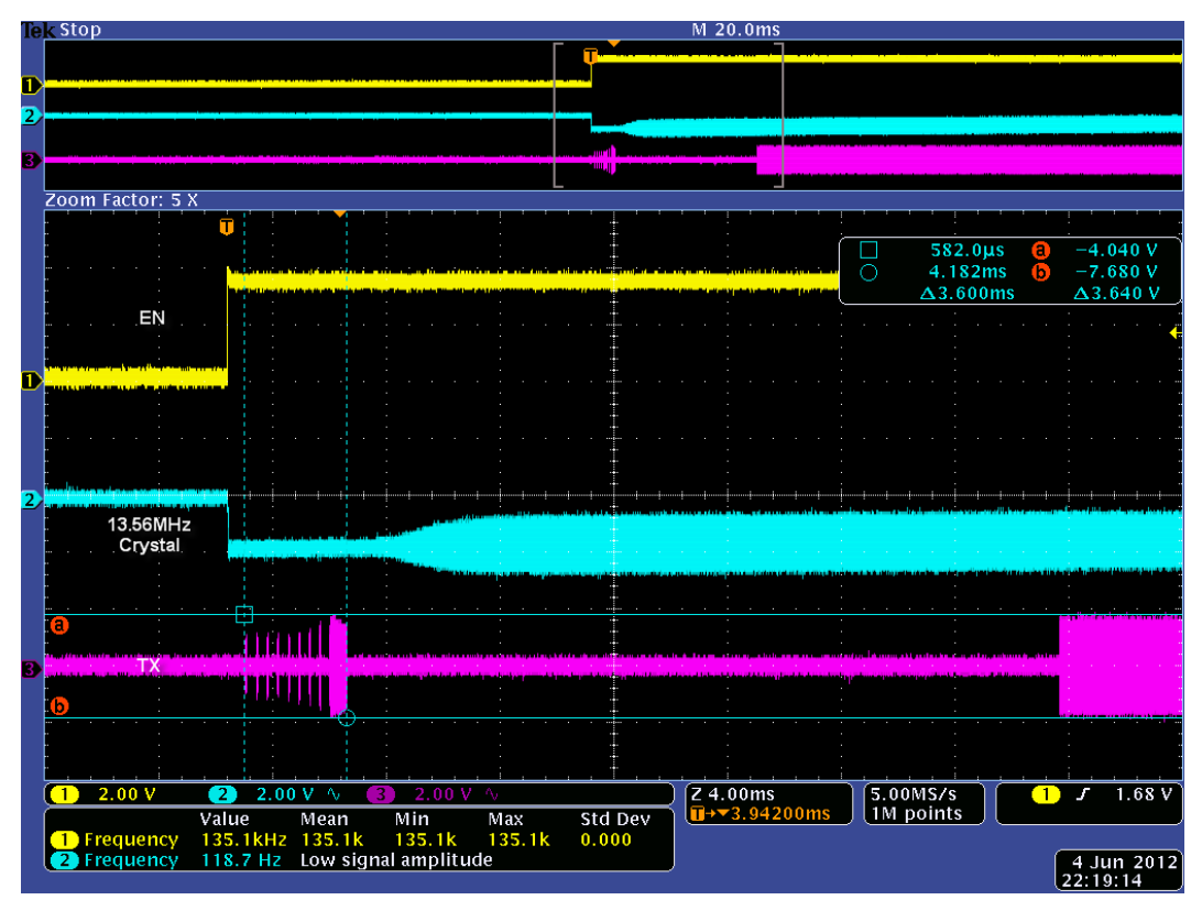
Figure 1. TX Out Behavior When EN is Line Raised (Register 0x0B left at default)

Yellow trace is EN line, blue trace is 13.56 MHz clock, pink trace is TX.