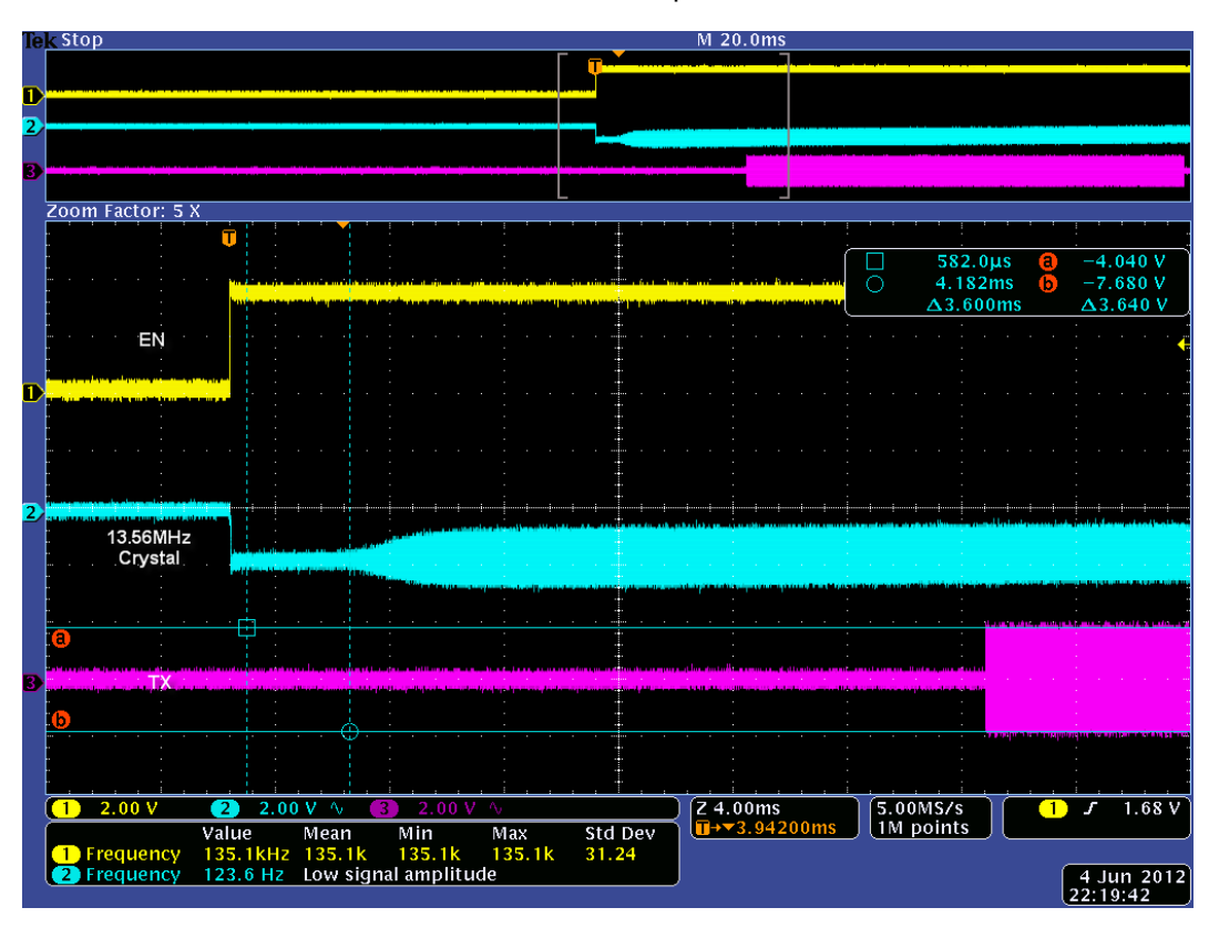
Figure 2. TX Out Behavior When EN is Line Raised (Register 0x0B set to 0x07)

Yellow trace is EN line, blue trace is 13.56 MHz clock, pink trace is TX out.