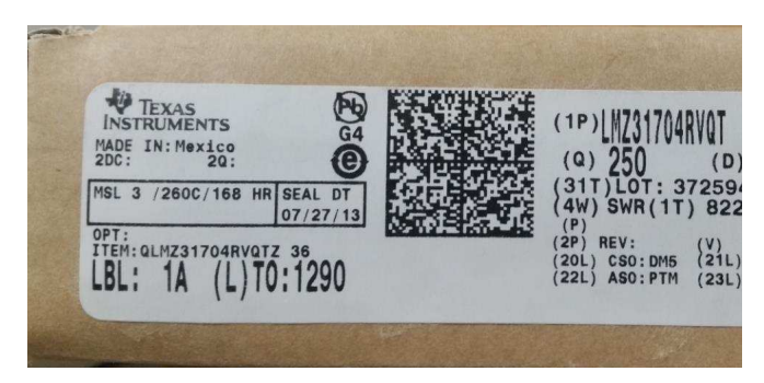
Figure 2. MSL Rating and Peak Reflow Labeling on Box