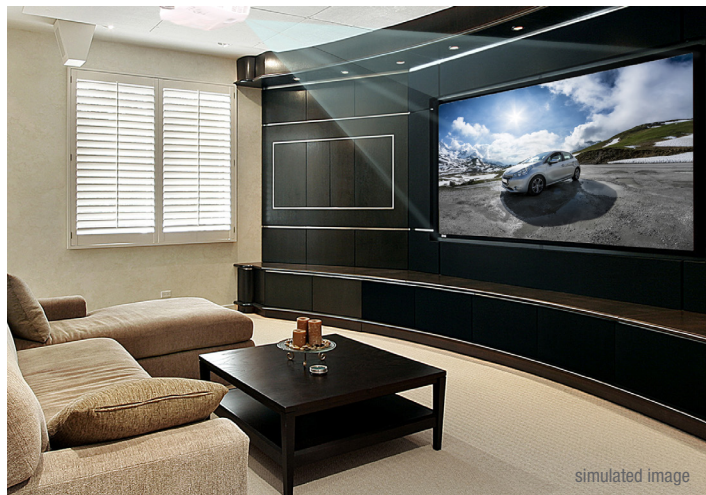
Home theater display using 4K UHD DLP technology

The chipset consists of the DLP660TE digital micromirror device (DMD), DLPC4422 digital controller, and DLPA1000 power management device. These devices can be combined with many different optical and mechanical components to meet a diverse set of performance level requirements. The chipset offers great versatility for numerous applications needing ultra-high definition.