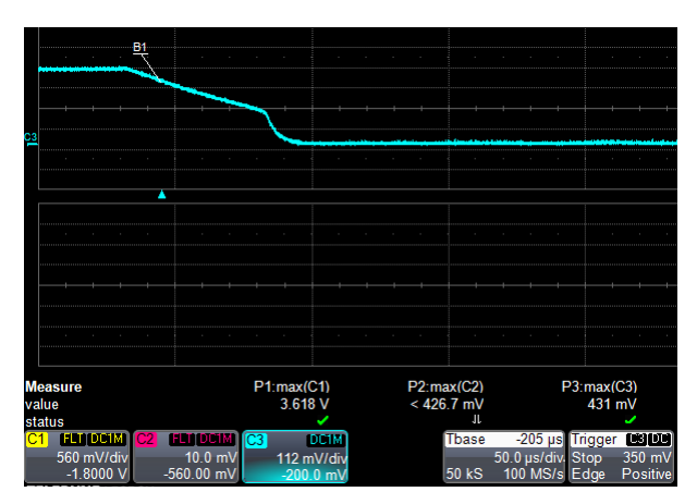
Figure 6. DRL Power down testing