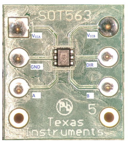
Figure 3. Soldered SN74AXC1T45DRL (Microscope Image)