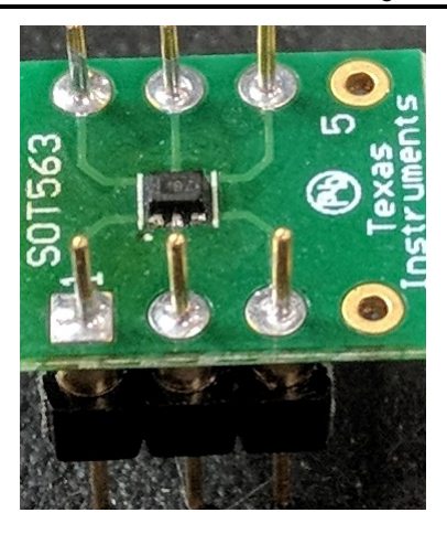
Figure 4. Soldered SN74AXC1T45DRL With Header Pins

The SN74AXC1T45DRL was soldered onto the generic EVM and tested for power up and power down at 3.6 V as shown in Figure 5 and Figure 6.