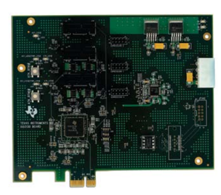
▲ XIO3130 Evaluation Board

The primary purpose of the XIO3130 as a fan-out device is to efficiently expand the root complex computing resources to multiple I/O ports, thereby enhancing system functionality and flexibility. Target applications for the XIO3130 include PCs, server HBA, embedded systems, industrial control and backplane, docking station, and add-in cards.