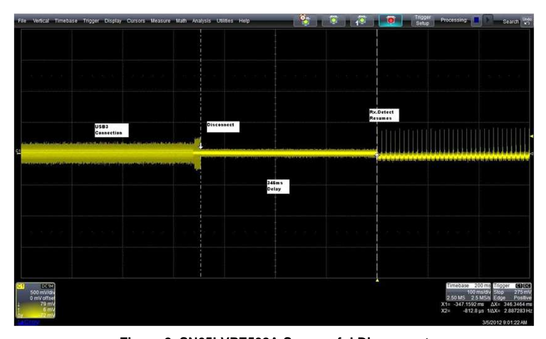
Figure 2. SN65LVPE502A Successful Disconnect

This issue is no longer driver dependant and is fixed in the SN65LVPE502A. A successful disconnect may be observed in Figure 2.