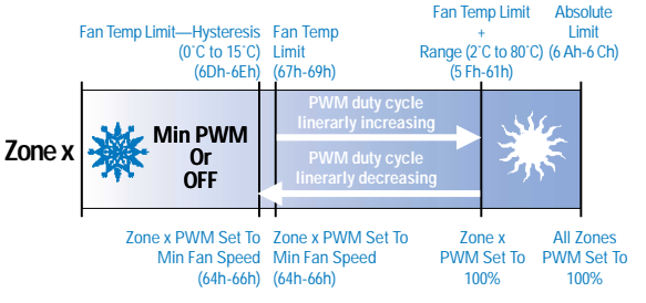
Figure 3: LM85 Fan Control Registers

Limit + Range). As temperature decreases, the PWM output will be at the minimum setting when the temperature reading is less than (Fan Temp Limit – Hysteresis). The minimum PWM can be set to any level. When the Absolute Limit is exceeded, the other two PWM outputs will be set to 100% duty cycle. Each PWM output can be assigned to any temperature zone, the hottest of one, two, or all three.