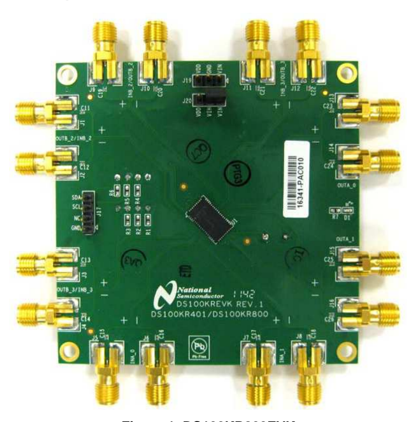
Figure 1. DS100KR800EVK (Top View)