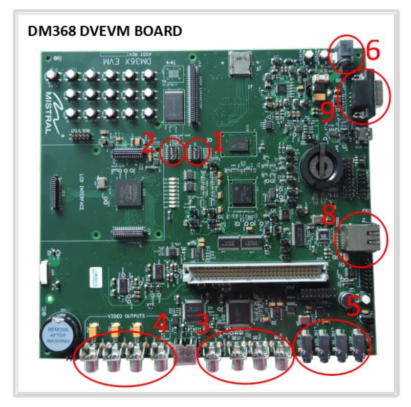
Figure 1. DM368 DVEVM Board