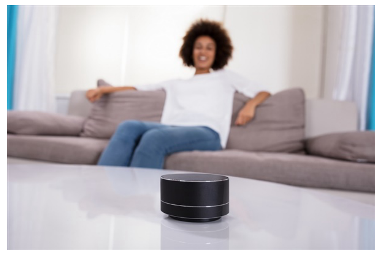
Figure 1. A smart speaker can hear you across the room, but can you hear it?

Unfortunately, there is a direct relationship between speaker size and output power. As smart speaker form factors shrink, so does speaker size. And when the speaker shrinks, so do the sound pressure levels that the speaker can generate, because it can no longer handle as much power. Smaller speakers mean quieter systems, but smaller speakers may also reduce intelligibility, with corresponding reductions in end-user satisfaction since they may not be able to hear the smart speaker's response from across the room (Figure 1).