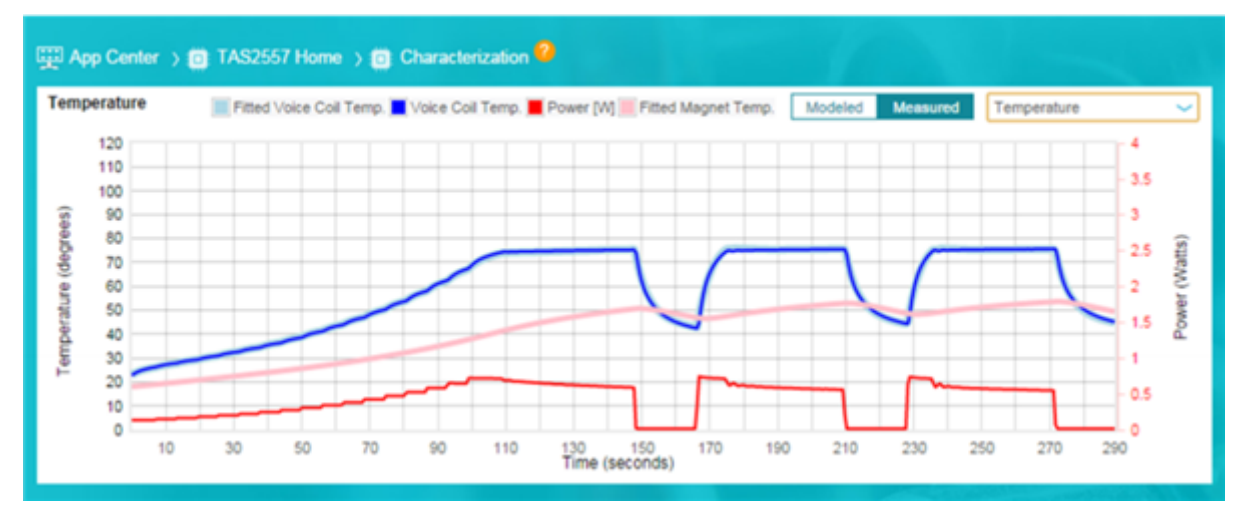
Figure 1. Speaker Coil Heating Time Constant

Unfortunately, the power needed to achieve high sound pressure levels (SPLs) will often exceed the continuous power rating of smaller speakers. These speakers have a heating time constant (shown in Figure 1) that allows for an exceeded continuous power level – but only for a brief period of time. If the power level doesn't quickly return to its normal level, the speaker can become damaged.