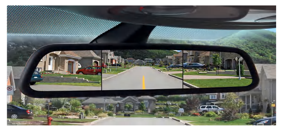
Figure 1. Three-camera Mirror replacement/CMS Example

The concept in Figure 1 shows a segregated method that has very distinct and separate views of three cameras (left/center/right). While certainly helpful, the driver's ability to process all of this information separately may not be as efficient; therefore, such an implementation may not be as effective and safe as it truly could be for drivers, their passengers and other vehicles on the road.