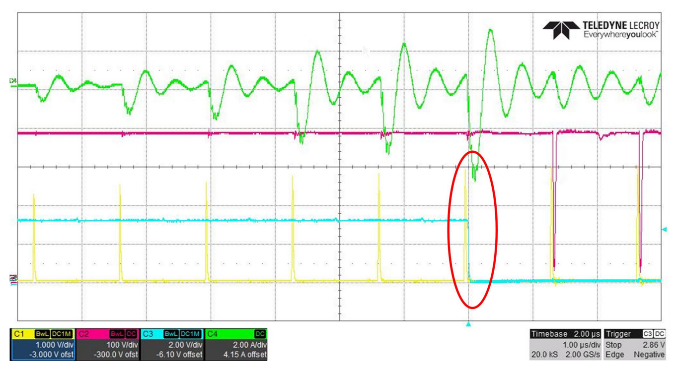
Figure 2. An TI LMG3410 Shoot-through Test on an LLC Series Resonant Half-bridge Converter: C1 = Low-side Switch Driving Signal, C2 = Switching-node Voltage, C3 = High-side Switch Driving Signal, C4 = Primary Inductor Current