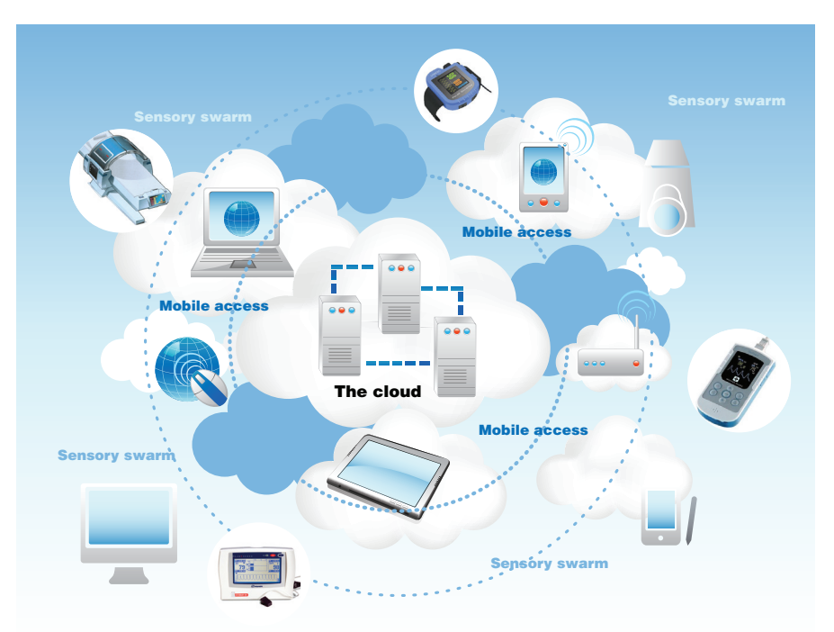
Figure 1. The swarm around the cloud.

While the number of nodes already linked to the cloud is huge, adding up to billions of units, it is dwarfed by the potential number of these new ULP systems that are starting to come