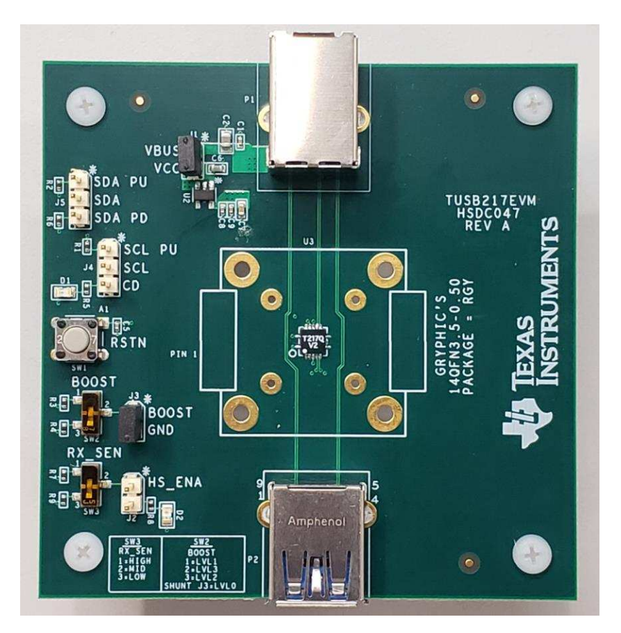
Figure 2. TUSB217EVM