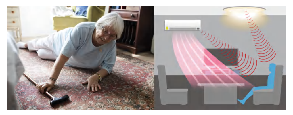
Figure 3. Building Automation Sensing Applications Using TI mmWave Sensors Include Elderly Monitoring and Air Conditioners.

Counting the number of people in a revolving door to avoid overcrowding or determining the height of an obstacle blocking a garage door is simplified by using an AoP design, which seamlessly fits into tight spaces where bulkier sensor modules are not feasible. An AoP sensor's small form factor seamlessly integrates into entrance systems while still covering a wide FoV for convenient door operation, as shown in Figure 4 .