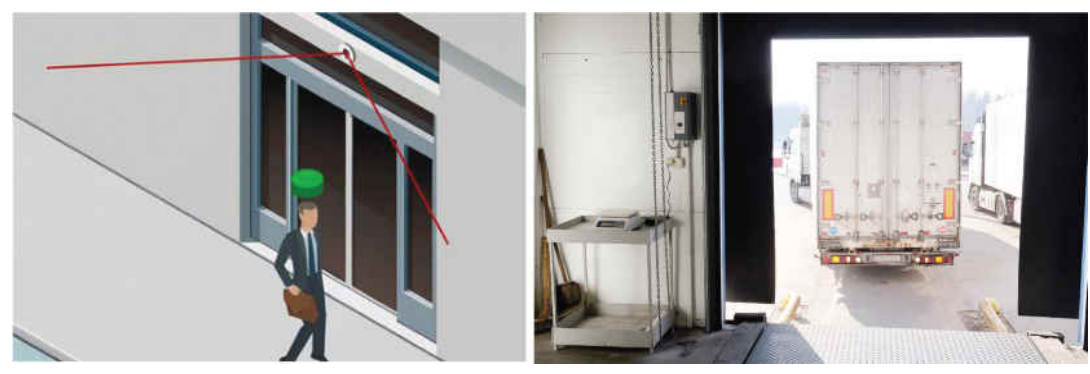
Figure 4. Examples of Automated Entrance Systems in Buildings and Warehouses Enabled by TI mmWave AoP Sensors.

Important Notice: The products and services of Texas Instruments Incorporated and its subsidiaries described herein are sold subject to TI's standard terms and conditions of sale. Customers are advised to obtain the most current and complete information about TI products and services before placing orders. TI assumes no liability for applications assistance, customer's applications or product designs, software performance, or infringement of patents. The publication of information regarding any other company's products or services does not constitute TI's approval, warranty or endorsement thereof.