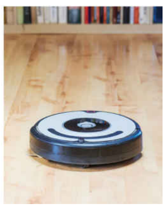
Figure 2. TI mmWave AoP Sensors Enable Automation in a Variety of Robots in Factories and Homes.