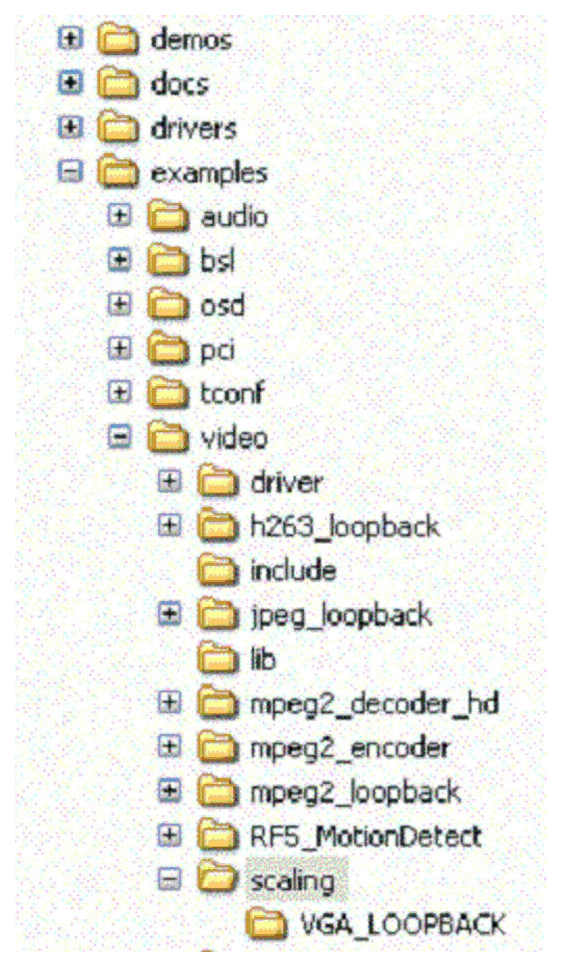
Figure 2. Example Location and Directory Structure