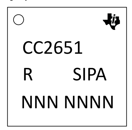
Figure 2-1. Package Symbolization

Figure 2-1 and Table 2-1 describe package symbolization and the device revision code.