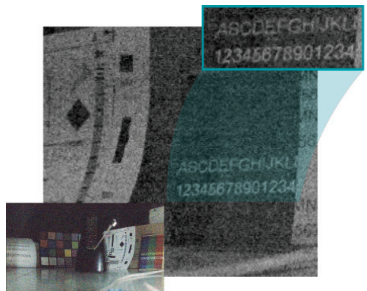
▲ Corresponding low-light scenes after TI's third-generation noise filter