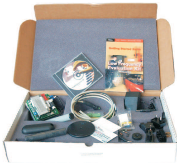
Part Number: RI-K2A-001A

This Low Frequency (134.2 kHz) Evaluation Kit includes the Series 2000 Standard Reader with RS232 Interface, a stick antenna, a variety of transponder packages for Read Only, Read/Write, Multipage or Selective Addressable applications, plus demonstration software that runs on your desktop computer to allow you to experiment with all the features of the RFID (Radio Frequency Identification) system.