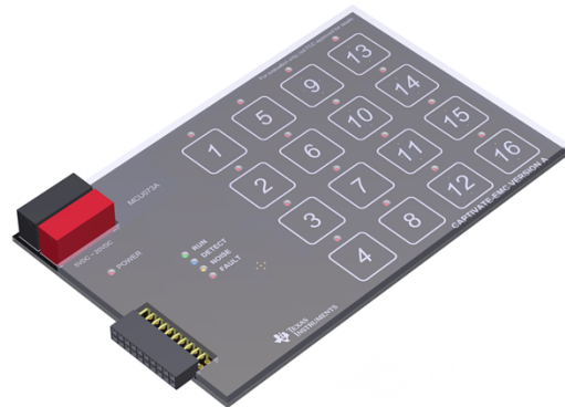
Figure 3: CAPTIVATE-EMC EVM.

The CAPTIVATE –EMC EVM was powered by 12 VDC from a PSM-UACTO3.3 VDC module.