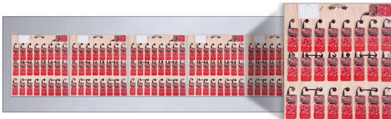
Figure 2. Testing the 15.4 stack over Sub 1-GHz with more than 150 nodes.

We perform precertification testing against regulatory standards in-house, followed by full certification by the respective regulatory agency or certification body. We also conduct a variety of performance characterization tests to assess power consumption, throughput and related parameters. After ensuring cross-platform validation for all common components, the QA and development managers must approve a validation review before release.