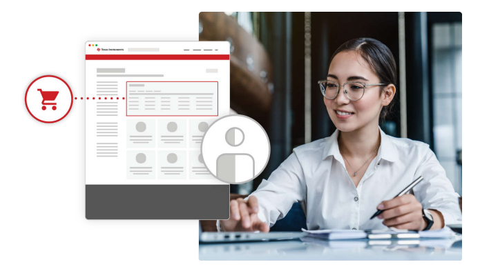
Figure 2. The myTl dashboard and myTl company account simplify the order management experience.

Over the last decade, TI has invested in self-service capabilities on TI.com to make it more convenient to purchase our products, automating the order management experience to make it easier to find the right qualified products for designs. We want engineers to have seamless access to our large and diverse product portfolios.