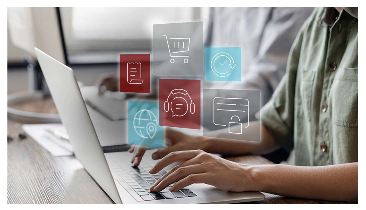
Figure 1. Self-service e-commerce capabilities help you make faster and smarter purchasing decisions.

These common practices have made semiconductor procurement more complex, costly and less reliable than it should be.