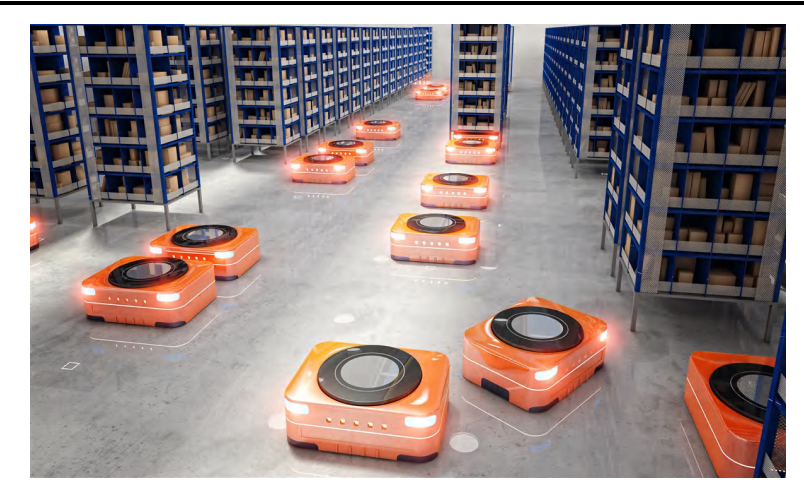
Figure 1. Industrial Mobile Robots as a Vision-based Control System

Many existing high-speed interface technologies can help enable the reliable transmission of high-resolution video data, but there are downsides for vision-based control systems. For example, standard technologies such as Ethernet come with additional latency because of protocol-related overhead. Since Ethernet physical layer devices cannot directly interface to the native video interfaces of sensors, they also require additional wires and components such as crystal oscillators. For example, a 4-MP, 30-fps high-resolution imager generates about 3.2 Gbps of video data. A single Gigabit-based Ethernet link such as 1000-BaseT does not provide sufficient throughput to carry this high-resolution data without compression, which introduces artifacts into the image stream that could in turn introduce errors in machine vision-based video processing.