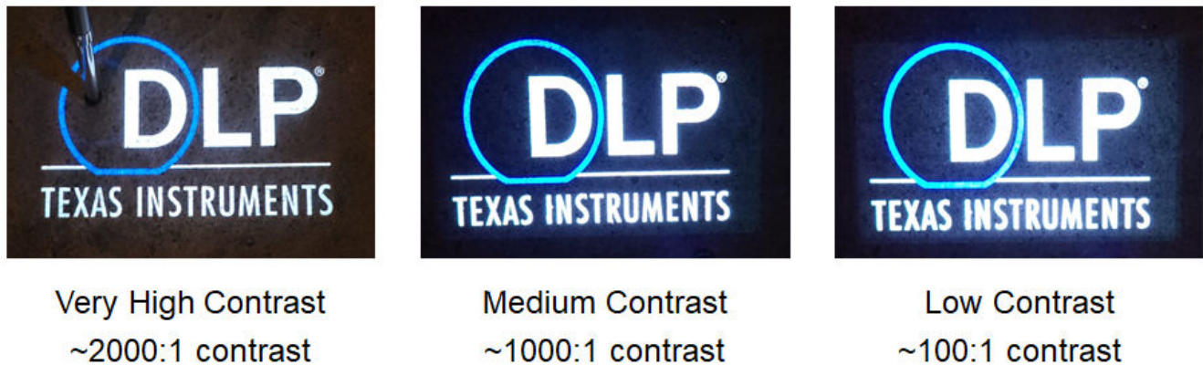
Figure 2-2. DGP projections with varying contrast

The contrast of a projector (or any display) is the ratio of brightness in a full-white image to a full-black image. Ideally displays would have infinite contrast, where any black pixel displayed emits no light, but in practice this doesn't happen. If a displayed contrast is too low, not as much detail can be seen in darker parts of the image. For a projected image with low contrast in a high ambient brightness environment, a dark border can sometimes be seen around the image, illuminating a grey box, or 'postcard' around the bright image in the center.