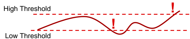
Figure 1. Programmable Thresholds for Monitoring

The autonomous monitoring capability of a device like the ADS7142 enables higher system reliability by raising an alert when the current consumption goes outside of the known good operating range. This could be caused by aging of the ultrasonic electrodes, changes in urban configuration requiring higher RF transmission time, aging capacitors and inductors, or software malfunction. All of these would cause higher current consumption that would be detected and preemptively addressed before the lifetime of the meter expires. Figure 1 illustrates the concept of using programmable thresholds to monitor a signal and wait for an alert.