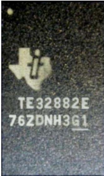
Example top marking