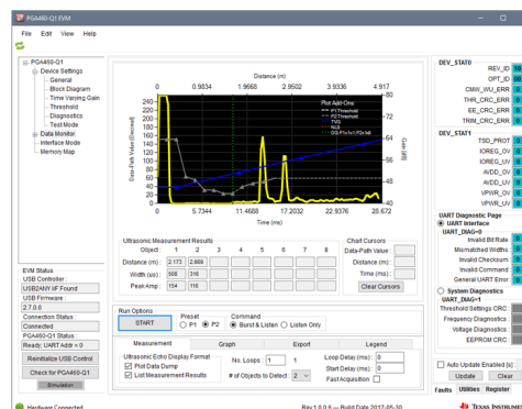
Figure 1. Typical Ultrasonic Decay Profile

High-quality transducers such as Murata's MA58MF14-7N have more stable and reliable decay or "ringing" during transducer excitation. By selecting a high-quality transducer, you can reduce the length of time of the decay and more accurately predict the stability of the decay as well. (See Figure 1 .)