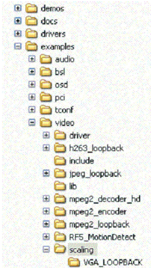
Figure 2. Example Location and Directory Structure