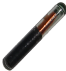
Figure 1-1. TRPGR30ATGC Transponder