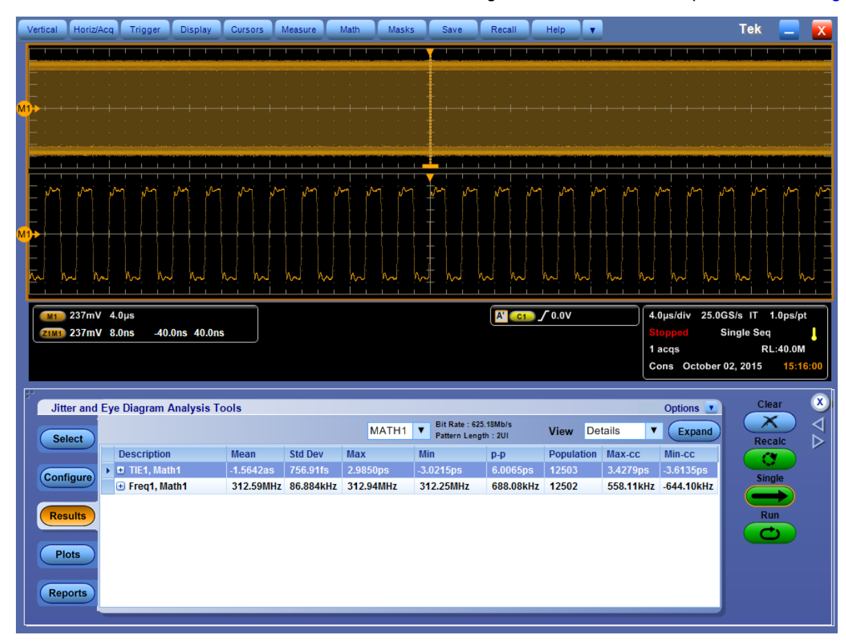
Figure 2. Unfiltered TIE Measurement Results

The unfiltered TIE measurement result for LMK61E2 using DPO70804C oscilloscope is shown in Figure 2