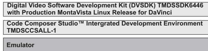
Figure 2. Required Tools