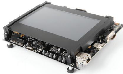
▲ AM437x Evaluation Module

The AM437x processors, based on the ARM Cortex-A9 core, are available to evaluate today at ti.com/am4379 . Development is easy and can begin in minutes with TI's all-inclusive development kit, which includes a 7" LCD touch screen and Gigabit Ethernet. Designers can begin development today with the $599 USD TMDSEVM437x general-purpose Evaluation Module.