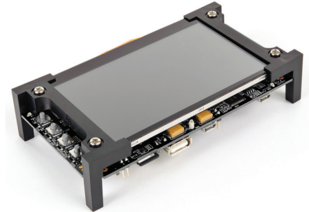
▲ AM437x Starter Kit

The AM437x Starter Kit provides a stable and affordable platform to accelerate development for HMI, industrial and networking applications. It is a low-cost development platform that is integrated with options such as dual Gigabit Ethernet, DDR3L, camera and a capacitive touchscreen LCD.