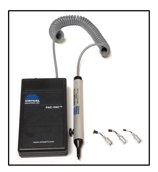
Example of battery-powered vacuum pen kit

This vacuum system solution works best with smaller WCSP devices for which the device is light enough for the vacuum to maintain a satisfactory hold. To best accomplish this, interchangeable vacuum pen tips with inner diameters within a certain range are necessary. If the opening is too small, the surface area of the die that is exposed to the vacuum may not be large enough to maintain a strong hold as even a slight jarring effect on the die could dislodge the tip. Too large, and the tip may not be able to grasp onto a continuous flat surface. An inner diameter size of 250um has worked well for this purpose. Tip material often comes in Delrin thermoplastic for normal use, or Torian polyimide for high-heat applications.