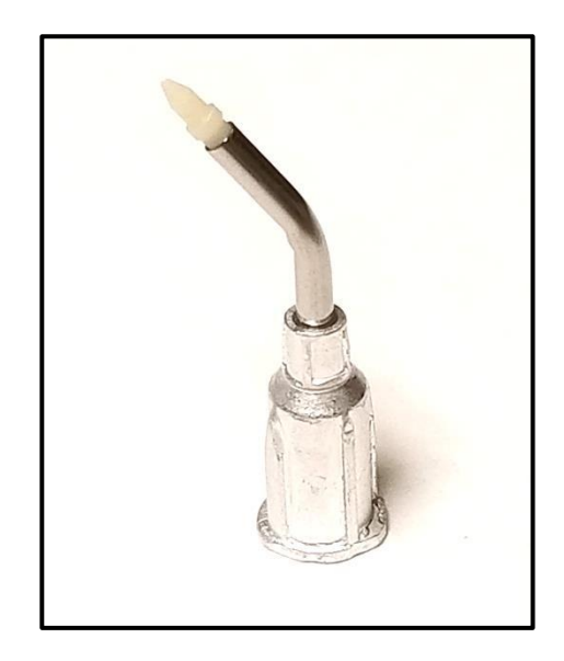
Delrin vacuum pen tip