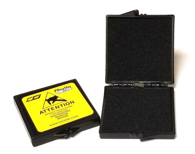
Small ESD-safe box with foam inserts

For transport of individual devices, or a small group of devices, foam ESD-safe boxes are an effective solution. However, the foam inserts must exhibit small voids only, or the WCSP devices (if they are small enough) could fall partially into the voids causing unnatural die stress when closed. 2"x2" ESD-safe boxes have been found to work well.