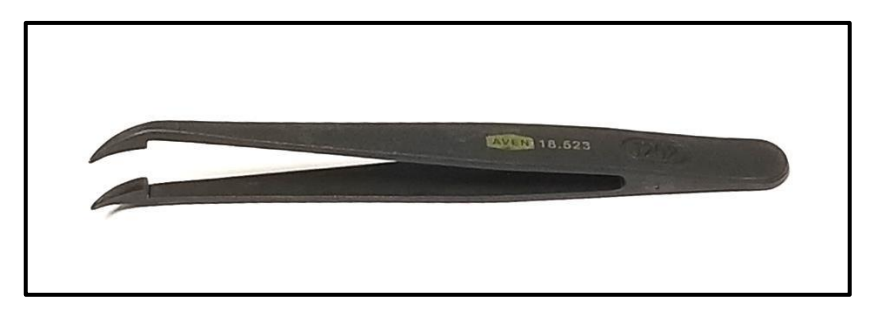
ESD-safe precision-tip plastic tweezers

Some WCSP devices are large enough that the vacuum pen system is ineffective – the devices are too massive for the moderate vacuum to maintain a sufficient hold. In these cases, tweezers must be used. However, the types of tweezers used for this task are critical. Only plastic, ESD-safe, tweezers are permitted for manual handling of large WCSP devices. The plastic will flex when in contact with die edges, limiting localized stress to the silicon lattice while still allowing a firm grip. The user must still take care to hold the device firmly enough that the die does not come loose during handling, but not strongly enough to cause damage to the die. The firmness required should become evident with practice. Curved, precision-tip, ESD-safe plastic tweezers are a good choice for manual handling of large WCSP devices.