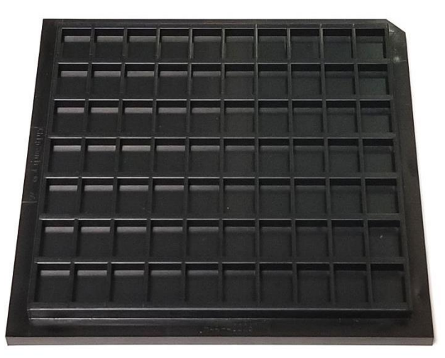
Waffle pack bottom grid

Note that the waffle pack grids, like the example shown below, will require covers and clips to completely enclose and secure the units to be transported.