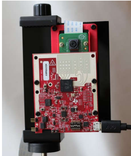
Figure 3. Camera and Radar Sensor Module Built With IMX219 and IWR6843ISK

For example, the camera and radar sensor module in Figure 3 uses an IMX219 camera and an IWR6843ISK EVM mmWave radar sensor . This module uses an object-level fusion approach that applies to both camera vision processing and radar processing chains that focus on object clustering and tracking; allowing engineers to track and detect objects in a three-dimensional environment.