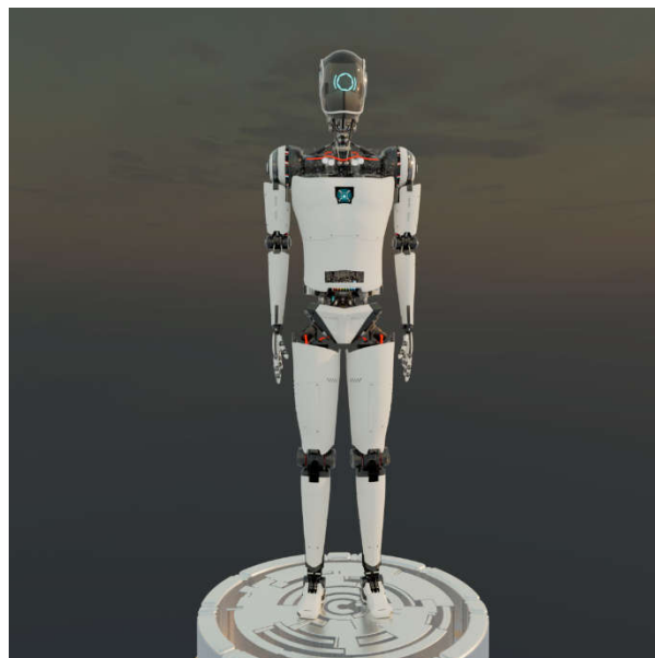
Figure 1. Modern Humanoid Robot

Humanoid robots (as shown in Figure 1 ) are rapidly transitioning from research platforms to production systems across manufacturing, logistics and service industries. For system integrators and OEMs, the core engineering challenges center on achieving reliable autonomous navigation in unstructured environments, implementing robust perception systems that function across varying operational conditions, and meeting functional safety requirements for human-robot collaboration.