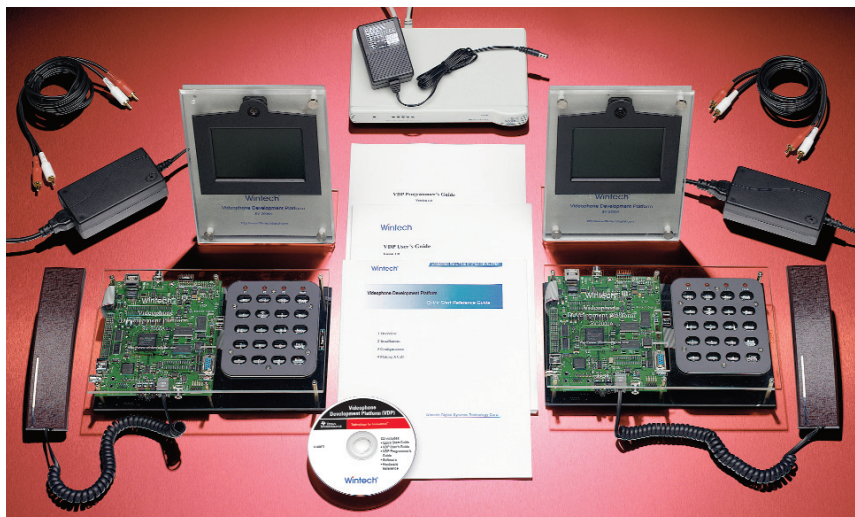
Each VDP is comprised of two DSP-based boards, two CCD cameras, two 5-inch LCD displays, two phone keypads as well as the software and documentation to get started immediately.

The key to the flexibility of the VDP is the programmable foundation of the DM643 digital media processor, which enables OEMs to customize the entire design, from CODEC to user interface and to create different product lines