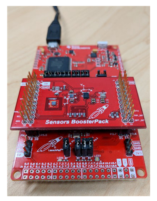
Figure 2. MSP-EXP432P401R LaunchPad Development Kit and BOOSTXL-SENSORS BoosterPack Module with SimpleLink SDK Plug-in Support

From a hardware perspective, the external components typically available on TI LaunchPad<sup>™</sup> development kits or BoosterPack<sup>™</sup> modules also connect together seamlessly, as shown in Figure 2.