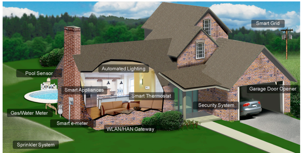
Figure 1. IoT-enabled home with connected devices and appliances working invisibly for consumers.

Consumers already have connected things like thermostats, energy meters, lighting control systems, music streaming and control systems, remote video streaming boxes, pool systems, and irrigation systems with more to come. Most of these systems have some connectivity through a Web site so that a user can manage them through a standard Web browser or a smartphone app, which acts as a personal NOC.