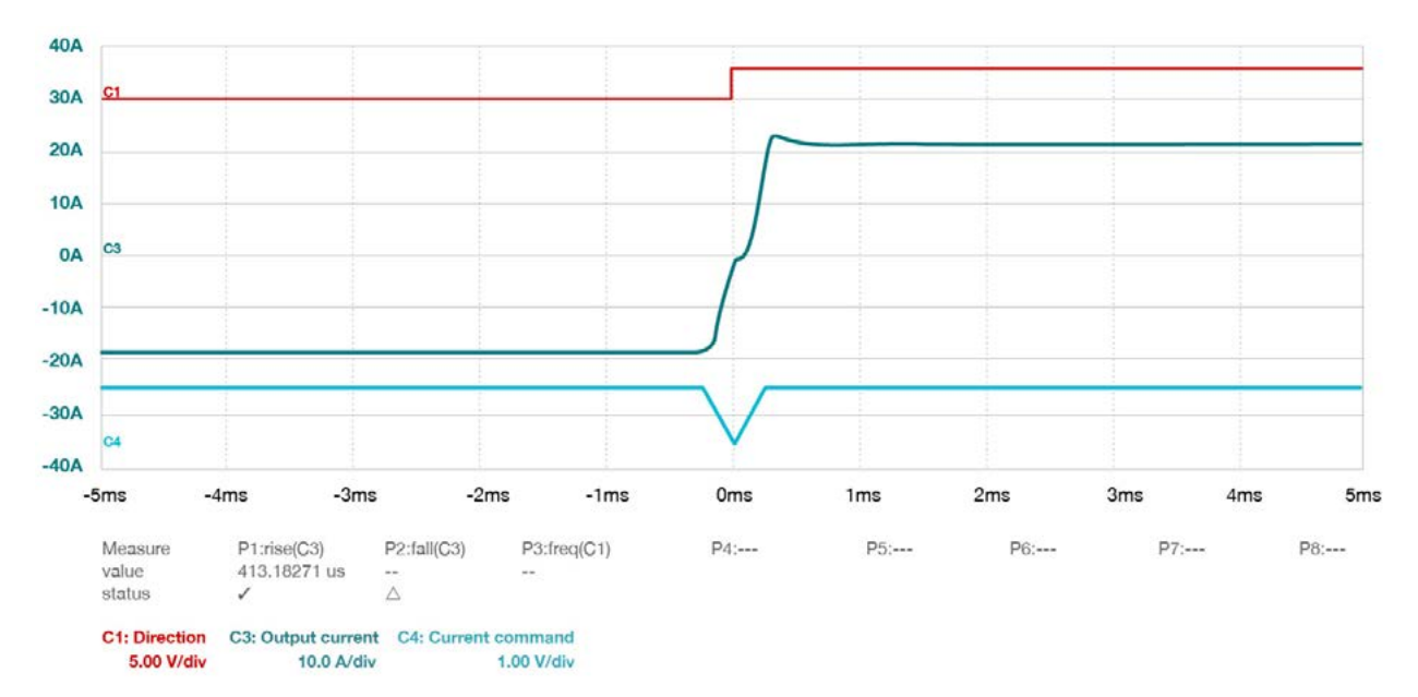
Figure 3. Current waveform during the transition from discharge to charge mode.

demonstrates that it is possible to address high accuracy, high current, speed and flexibility without heavy capital investments in battery test equipment. Rather than investing in multiple architectures for different current levels, you can now test a range of currents so that your high-current equipment no longer remains idle when testing low-current batteries.