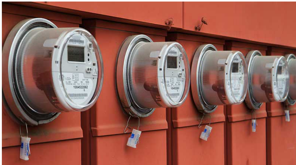
Figure 1. Smart Meters

For battery-powered applications, this input current comes from the battery, so it determines how long the battery operates before it either needs recharging (for rechargeable batteries, such as lithium-ion (Li-Ion) or nickel metal hydride (Ni-MH)) or replacing (for primary batteries, such as alkaline or lithium manganese dioxide (Li-MnO 2 )). For battery-powered applications that spend a large amount of their time in standby or sleep mode, I_Q can impact the battery's run time by years. For example, using an ultra-low- I_Q buck converter like the 60-nA TPS62840 to power an always-on application, such as the smart meters shown in Figure 1 , enables 10 years of battery run time.