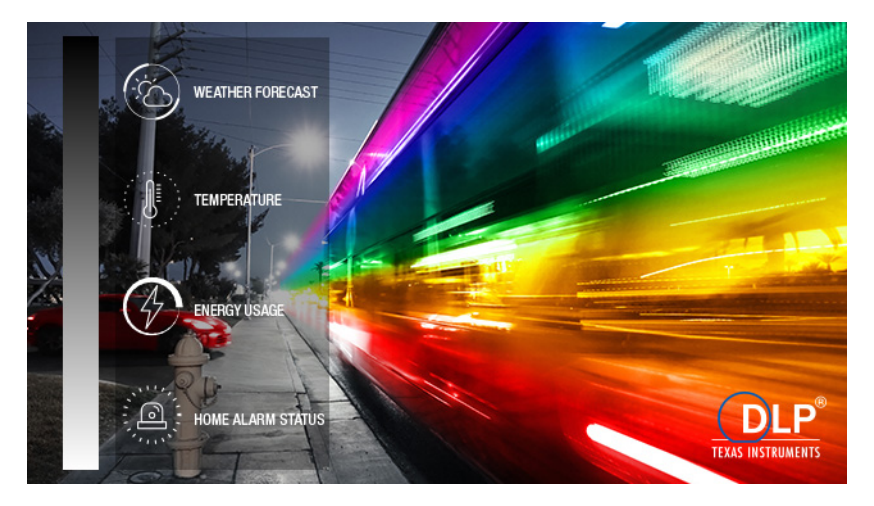
Figure 2-3. EVM Splash Screen

6. The focus of the image can be adjusted with the focus switch on the optical engine.