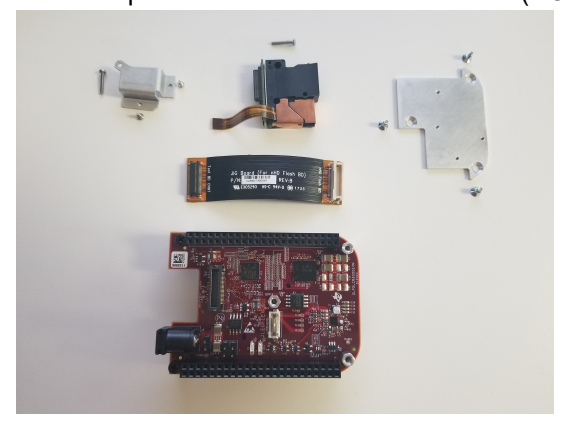
Figure 2-1. Disassembled EVM Assembly

Prepare the necessary mechanical components to install the DLPM2000EVM to the DLP LightCrafter Display 2000 EVM. If using a DLPDLCR2000EVM purchased after March 2020, the included mechanical assembly is compatible with the DLPM2000EVM. Please refer to the TIDA-01473 TI Reference Design for more information on this assembly and a complete mechanical bill of materials (BOM).