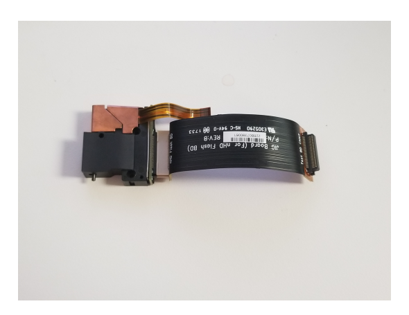
Figure 1-1. DLP Module 2000 EVM (Standalone)

The DLP Module 2000 EVM (DLPM2000EVM) is a low-cost replacement optical engine for use with the DLP LightCrafter Display 2000 EVM (DLPDLCR2000EVM). It uses the same electronic connections as the stock optical engine and can be swapped into the system without any modification to DLPDLCR2000EVM board firmware. The DLPM2000EVM features a unique design which is not compatible with the stock mechanical mounting components of the original DLP LightCrafter Display 2000 EVM. For the best experience, it is recommended to use the provided mechanical assembly reference design to create a new plate for mounting the EVM.