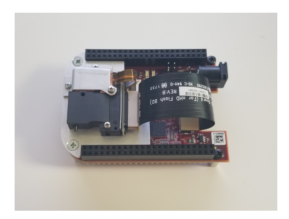
Figure 1-2. DLP Module 2000 EVM (Installed to DLPDLCR2000EVM, not included with DLPM2000EVM)