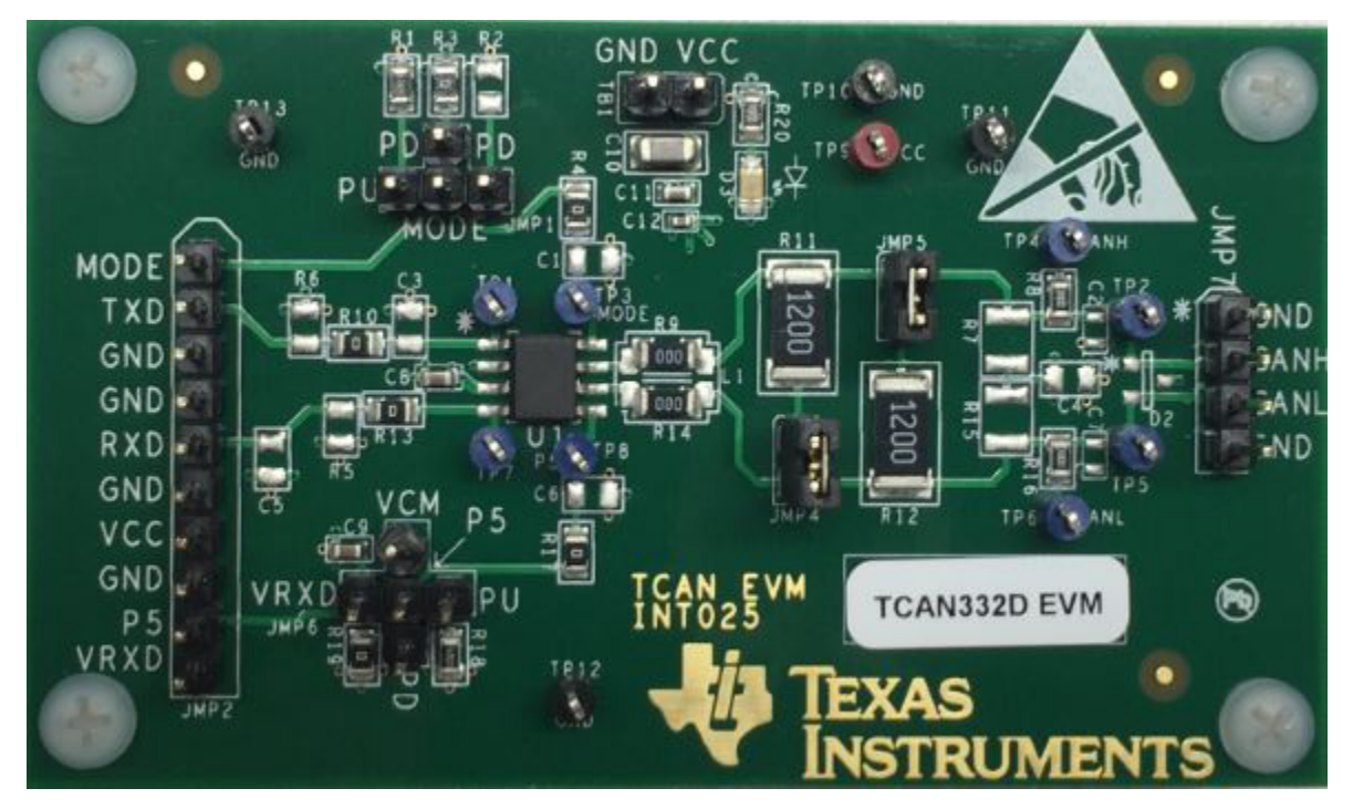
Figure 1. EVM PC Board

The CAN EVM has simple connections to all necessary pins of the CAN transceiver device, and jumpers where necessary to provide flexibility for device pin and CAN bus configuration. There are test points (loops) for all main points where probing is necessary for evaluation such as GND, V_{CC} , TXD, RXD, CANH, CANL, Pin 8 (mode pin), or Pin 5 (various functions). The EVM supports many options for CAN bus configuration. It is pre-configured with two 120- \Omega resistors that may be connected on the bus via jumpers: a single resistor is used with the EVM as a terminated line end (CAN is defined for 120- \Omega impedance twisted pair cable) or both resistors in parallel for electrical measurements representing the 60- \Omega load the transceiver "sees" in a properly terminated network (i.e. 120- \Omega termination resistors at both ends of the cable). If the application requires "split" termination, TVS diodes for protection, or Common Mode (CM) Choke, the EVM has footprints available for this via customer installation of the desired component(s).