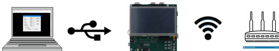
Figure 5-1. Wi-Fi Station Hardware Setup

The following section details how to get WiLink8 device to be a STA mode and connect to an access point and verify the connectivity between the station and AP. This uses the same hardware setup as detailed earlier.