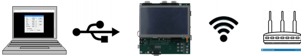
Figure 4-1. Basic HW Setup Using AM335x and WiLink8 for Driver Bring-Up

The following steps use HW setup using AM335x EVM along with WL1837MODCOM8I module. The SD card can now be mounted to SDRAM1 slot on AM335x EVM. Connect UART cable from J12 UART connector to PC. Run any terminal program (ex: TerraTerm) with baud rate configured to 115200, 8 bits, no parity. BeagleBone Black along with Element 14 Wireless Cape can also be used as an alternative to the below setup.