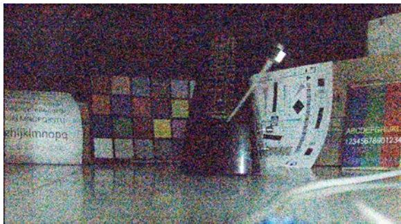
Noisy color image before filtering