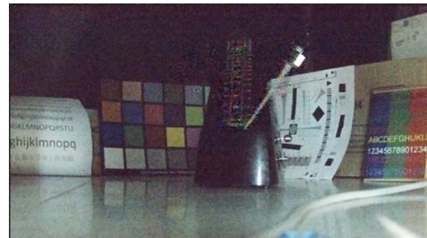
Higher quality color image after filtering