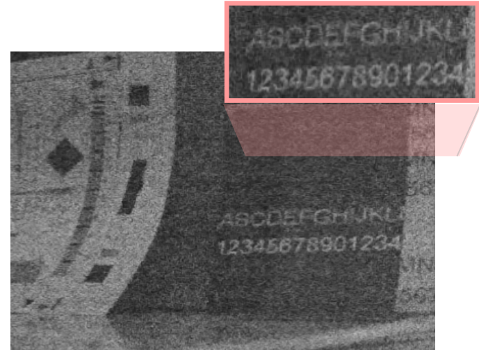
After Noise Filtering Detail emerges