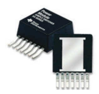
Figure 2. View of a leaded module with an exposed ground pad. As with embedded modules, the "3-D" manufacturing approach by which the inductor is placed above the converter die shrinks the footprint of the module relative to an equivalent discrete solution. Visible external leads mean that soldering and debugging circuits by hand is much simpler than it would be using a no-lead module such as a QFN. Visible leads also means that making changes to prototype boards is easy. External leads are beneficial in manufacturing, where solder integrity can be verified by visual inspection.

Leaded modules such as the LMZ14203 are the easiest to use of all of the module packages, as they provide the same benefits engineers have come to expect from leaded ICs. Leaded modules are manufactured by attaching the die to the underside of the top lead frame, which is then mated to the top of the bottom lead frame. The bottom lead frame serves as a base for the module, and has a large exposed pad that enables the module to dissipate heat effectively during operation. The inductor and resistors are placed on the top side of the top lead frame, which is molded with epoxy to encapsulate the components while leaving the leads exposed. Figure 2 illustrates the final result of this manufacturing process.